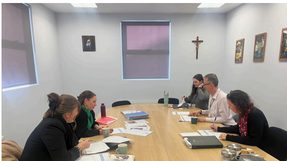
Senior Leaders collaborating at a recent RJED meeting

The session aimed to not only support the professional growth of teachers but also to ensure that all children, regardless of their learning requirements, can access high-quality education. The workshop focused on providing a flexible and adaptive curriculum that allows for progress, regardless of a child's developmental stage.